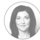
Katherina Reiche Chairwoman National Hydrogen Council Chairwoman of the Board Westenergie, Germany